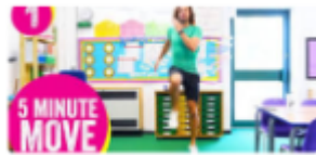
5 Minute Work Out