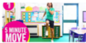
5 Minute Work Out

Hirza's Set- Think about ways in which you are kind to others. Draw to show one of the ways in which you have been kind. Try to write a sentence to explain.