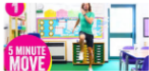
5 Minute Work Out