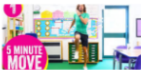
5 Minute Workout