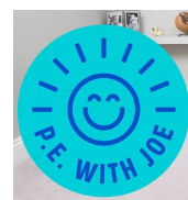
PE with Joe Wicks