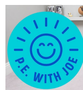
PE with Joe Wicks