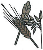
Cereals containing gluten